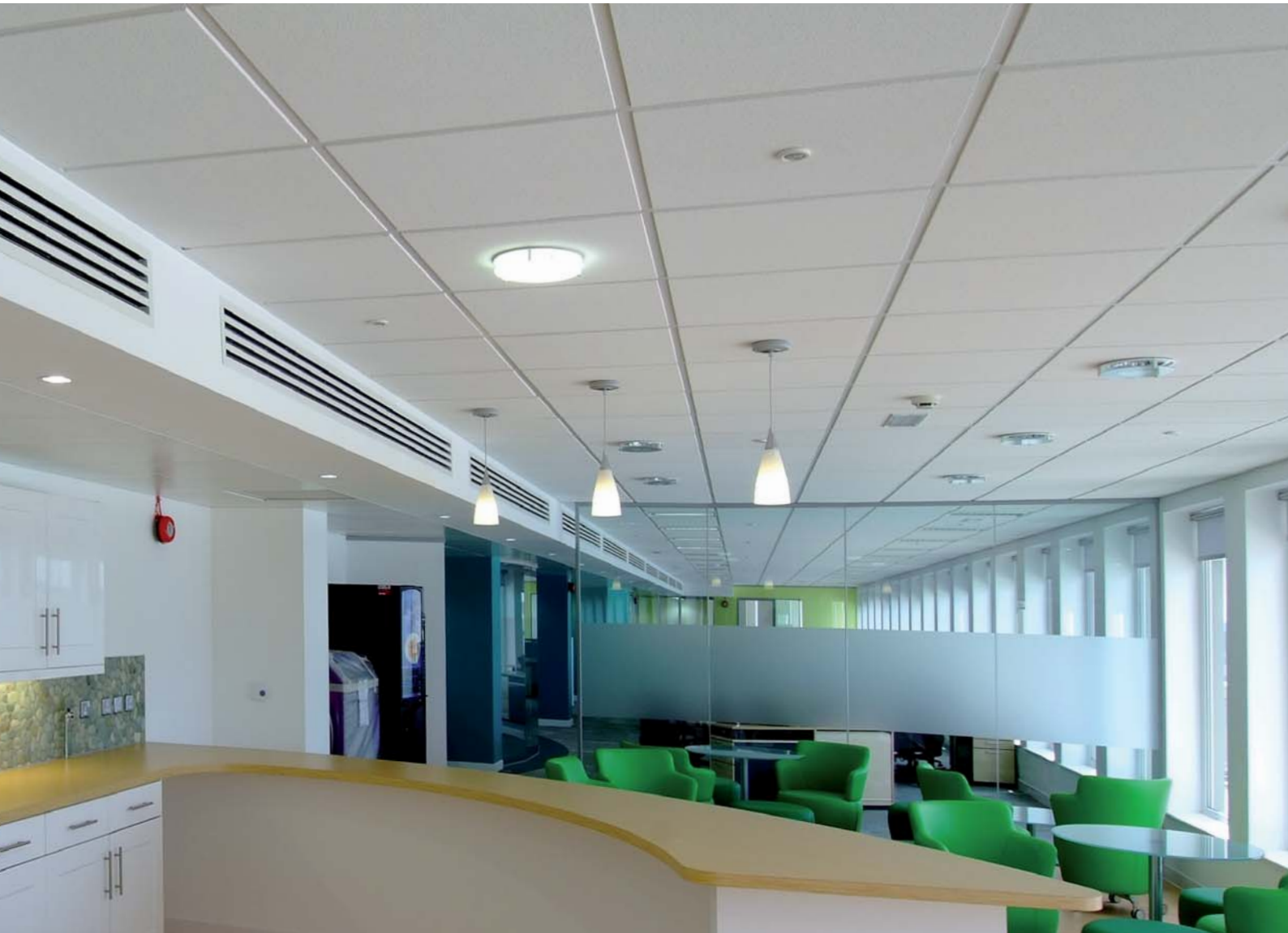
DUNE Angled Tegular with Peakform Prelude XL 24mm Exposed Tee Grid