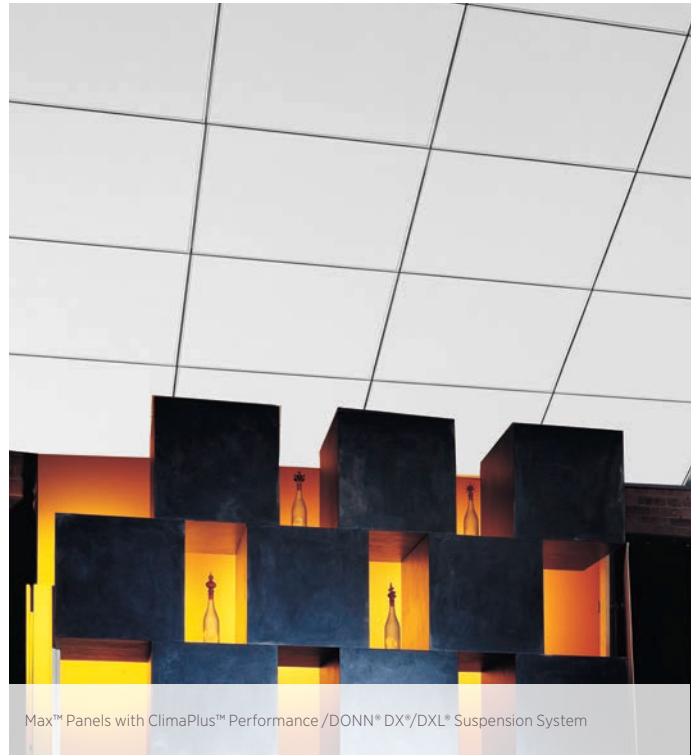
Max™ Panels with ClimaPlus™ Performance /DONN® DX*/DXL* Suspension System